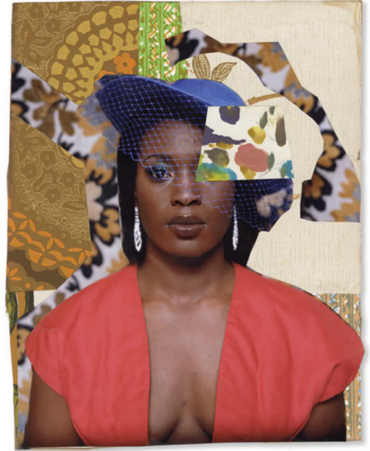
TO BE TITLED (QUSUQUZAH) 2018

Impressionism: style of art developed during the late 19th century - early 20th century characterized by short brush strokes of bright colors in juxtaposition to represent the effects of light on objects.