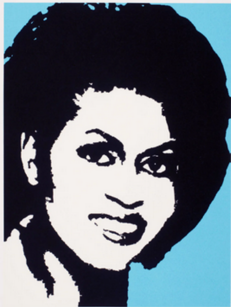
MICHELLE O 2008