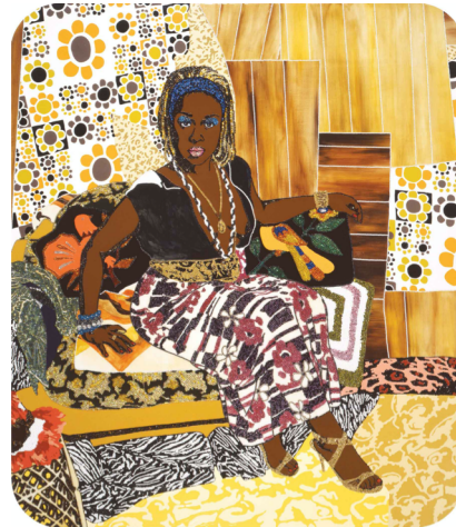
This Girl Could be Dangerous, 2007