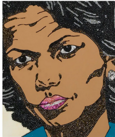
WHEN ENDS MEET 2007