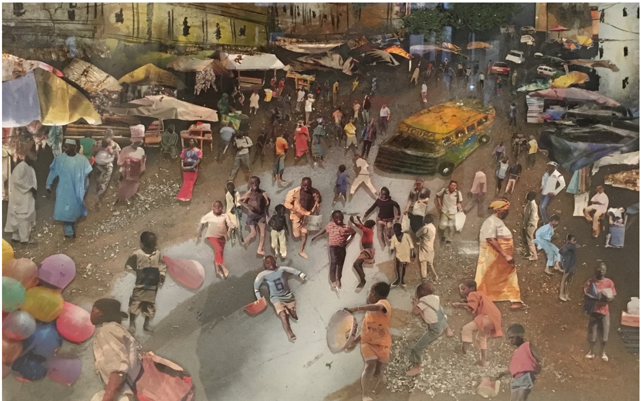
Fally Sene Sow, Talibé yi ci mbeddu colobine , 2018, collage under glass

In this picture, Fally Sene Sow combines souwere (under glass) painting and collage to show a busy marketplace in the artist's hometown of Dakar, Senegal, in West Africa. He shows buyers and sellers, buildings and stall umbrellas, vehicles and lots of people. He has gathered bits and pieces from the marketplace, including magazines, foil, and twine, as well as the plants and sand of Dakar's streets in his picture. The scene becomes familiar thanks to this method of gathering individual elements and collaging a sense of fondness—a sense of home.