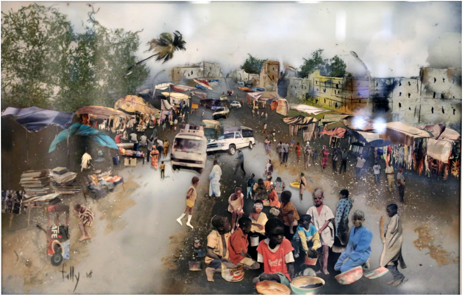
Fally Sene Sow, Tilén by Night , 2018, collage under glass