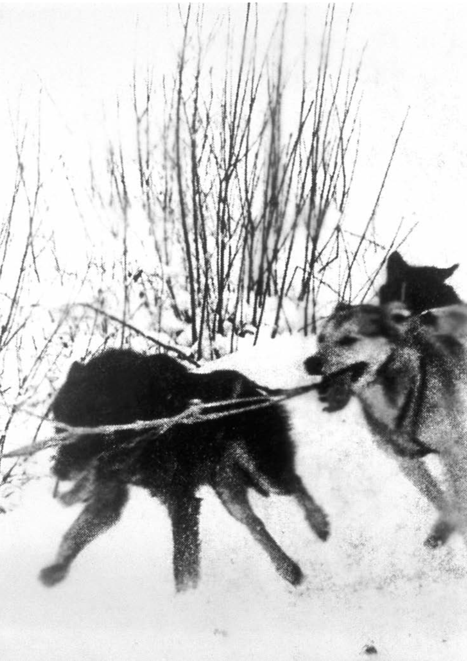
Bush , 1999, gelatin silver print, 72 x 48 in.