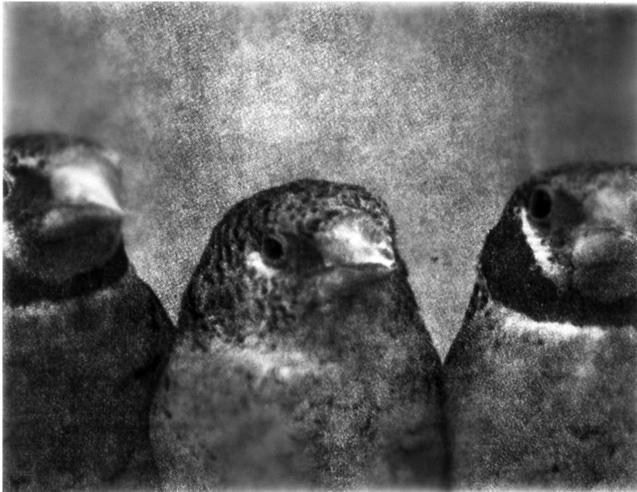
Three Birds/Front View , 2000-2001, gelatin silver print, 50 x 65 in.