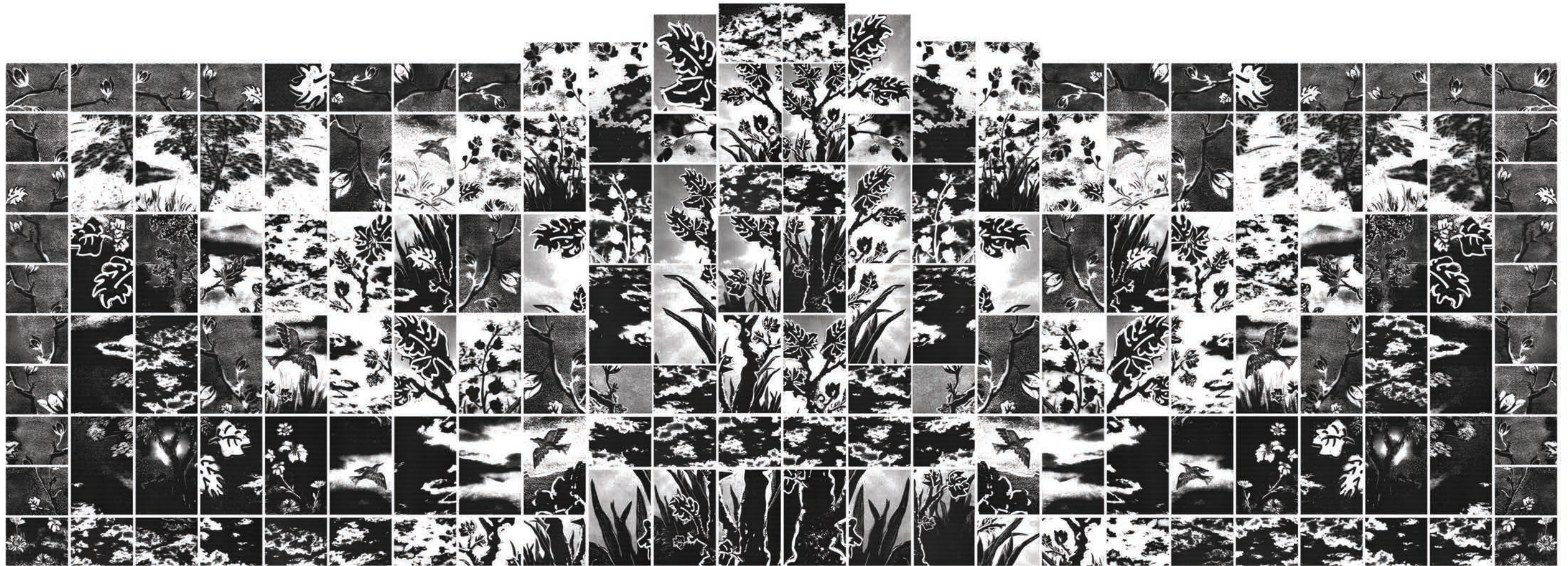
Eden , 2012-2013, inkjet on paper, 120 x 330 in.

appear very still, even with the sled dogs in mid-run and the birds in mid-head cock. There is something in the inky darkness of the shadows and vast whiteness of the snow that transfigures the animals into still lifes and momentarily takes your breath away.