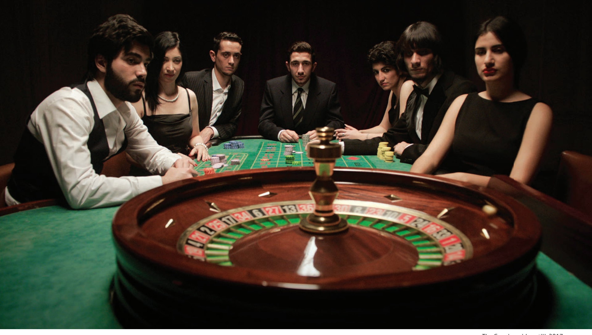
The Crossing, video still, 2017