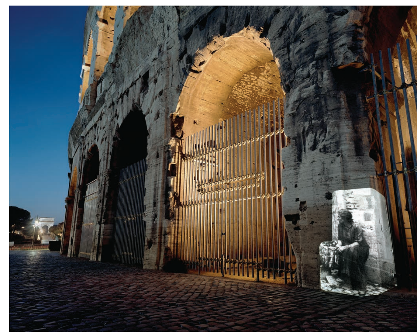
At the Coliseum (Looking towards the Arch of Titus) from The History of Another, 2003

Using ancient Rome as a backdrop and foil for the grand history of the West, The History of Another features historical photographs of individuals projected onto these sites in order to raise questions about who is inside and outside of this history. The projected photographs of individuals of Roman Jewish background were taken at the turn of the 20th century, in many cases near the projection sites. The ghostly and evocative images invite reflection on the history and intersection of these two ancient cultures, raising broader questions about "otherness" within the history of the West.