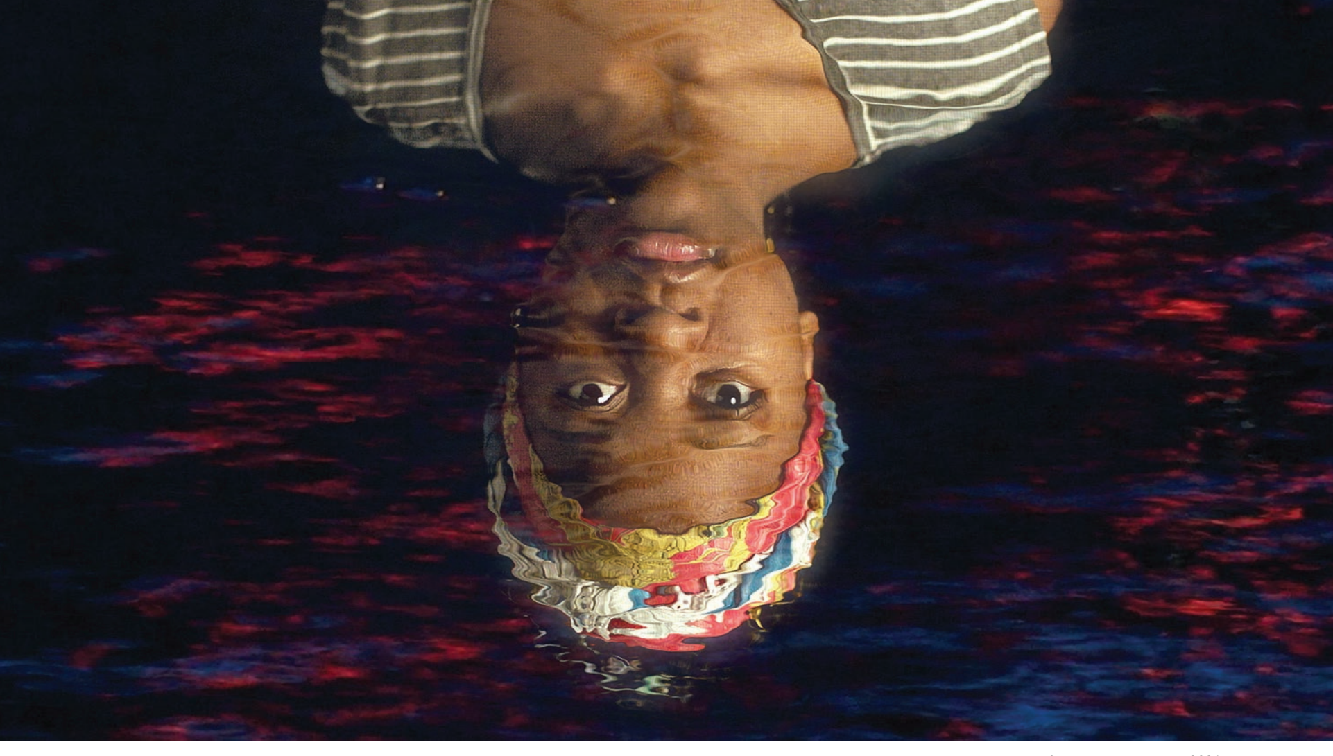
The View from Below, video still, 2021

The View from Below, 2021 Single channel video, 3 minutes, 20 seconds