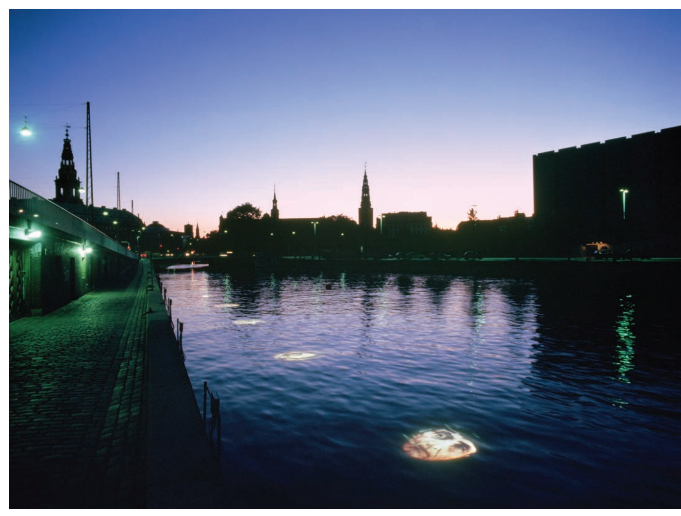
Portraits of Exile, installation shot, 1995

For Portraits of Exile , nine large light boxes mounted with transparency images were submerged underwater in Copenhagen's Borsgraven canal just in front of the Danish parliament building. The project presented two human rights stories and challenges: the heroic Danish rescue of their Jewish community on fishing boats to Sweden in 1943, and the more ambivalent Danish response today to present-day refugees. As the shared thread between these two stories of rescue is water, the underwater installation embodied these issues over a six week period.