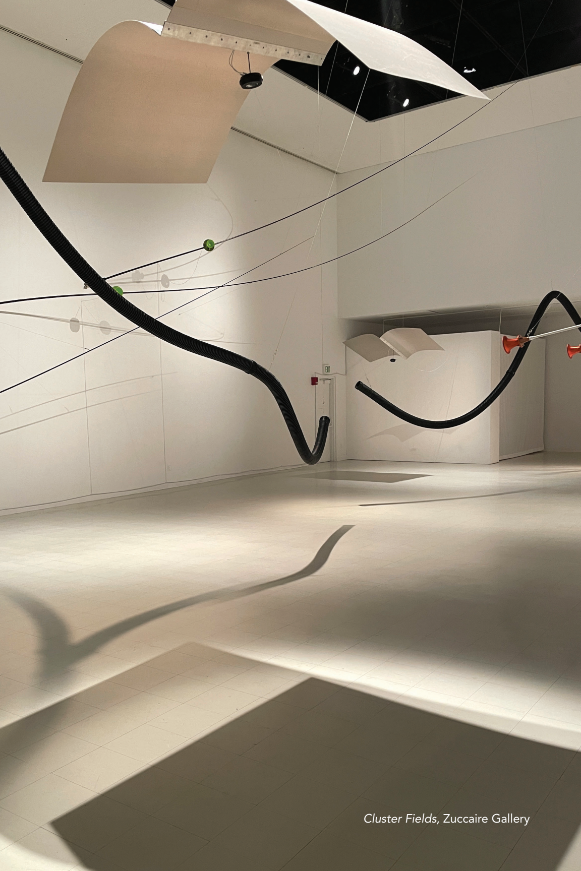
Cluster Fields, Zuccaire Gallery