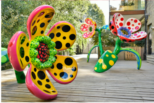
Yayoi Kusama, Flowers That Bloom At Midnight, 2018