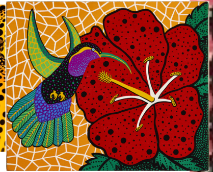
Summer is Forever, 1989