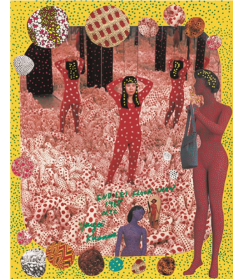
Endless Floor Show, 1965