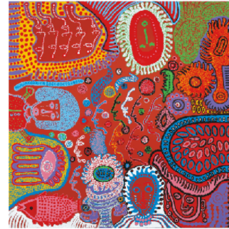
My Eternal Soul, 2009