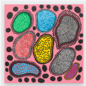
My Hope for Peace, 2019