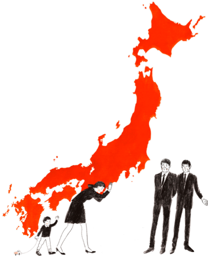
illustration by Peter Oumanski