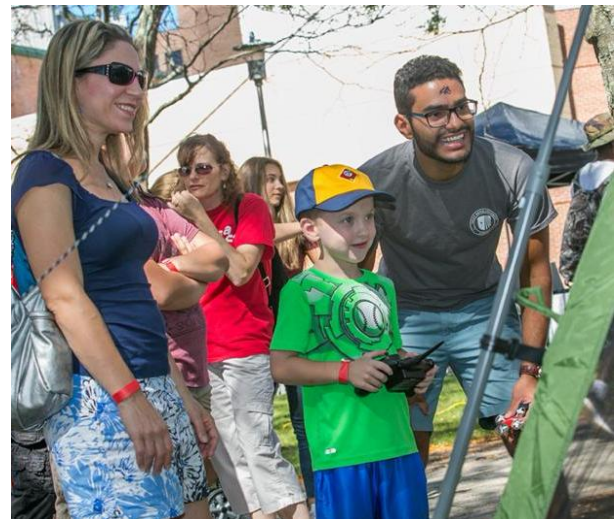
Family fun was had by all at Stony Brook's first CommUniversity Day in September.