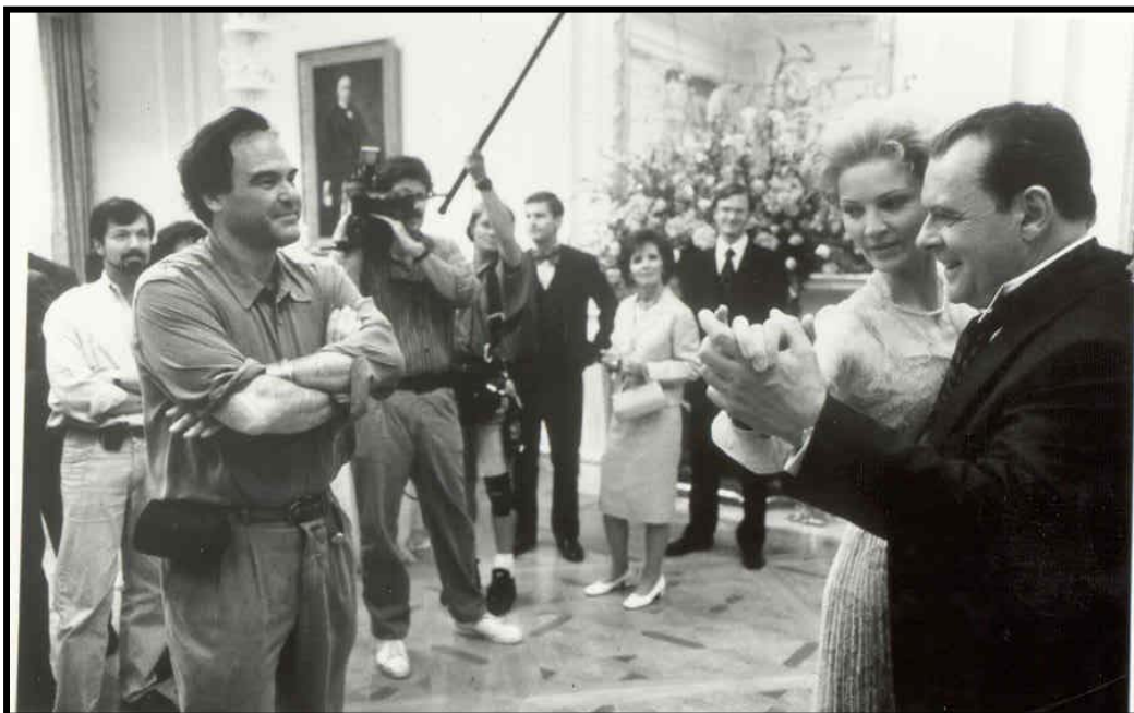
OLIVER STONE DIRECTING NIXON

This course will address these questions and more through the viewing of several major motion pictures and selected readings. We will be looking at these films not only to get a sense of the “history” that is being presented but also the ways in which the various films reflect the time period in which they were actually produced. Course work will include two short papers and a final exam, part take-home, part done in our last class. Daily attendance and participation in discussion will also be required.