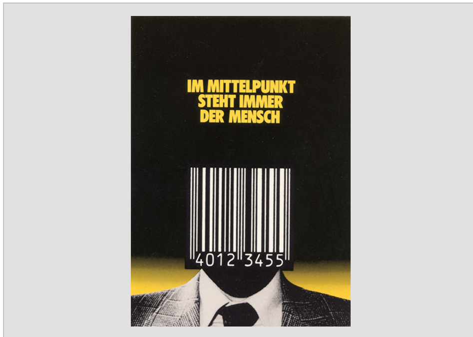
Figure 4: Poster by Klaus Staeck, 1981 136

The thrust of these arguments are nicely captured in the poster by the graphic artist Klaus Staeck (Figure 4), whose caption reads »The individual always stands at the centre« or, in a more figurative rendering »Man (or the unalienated individual) is always the measure.« The way in which the face (or the head, in either case, the seat of the person's individuality) is covered or replaced by a bar code symbolises the ways in which the fullness of individual experience is always attenuated or reduced by being forced into the statistical categories that reflect the logic of technocratic rule. It is, however, impossible to determine whether the caption is intended to be read as a description of reality (which seems unlikely) or as an imperative to be realised – or whether it represents an ironic comment on the growing distance between ideal and reality.