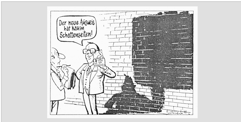
Figure 2: Der neue Ausweis hat kaum Schattenseiten 55

As one pamphlet warned in apocalyptic language taken from Aldous Huxley rather than Orwell, the »caylon« of new information technologies and the creeping progress towards the ability to instantaneously register each and every member of the population was bringing about the advent of a »brave new world«. The dystopian future that this group of protesters saw looming before them took the form of