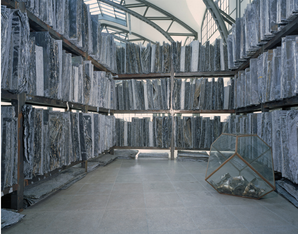
Figure 5: »60 Millionen Erbsen«, 1987 138

agentur für Arbeit«); and household information were be constructed from individual information on the basis of a shared address and other data. 139