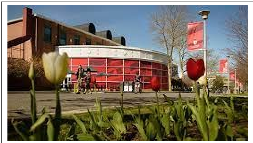
Stony Brook University