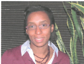
Dr. Claudine Gay Harvard University

Please visit our departmental web site, www.sunysb.edu/polsci , which has a new link for Alumni. That link will take you to past issues of the alumni newsletter, a list of our Distinguished Alumni Award winners, and an online giving page. Contributions to the department have been used toward special student scholarships, classroom multimedia upgrades and other departmental activities.