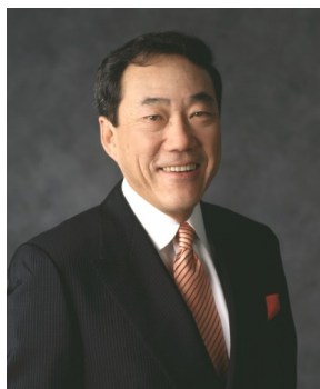
Charles Wang, Chairman Emeritus Computer Associates International, Inc.