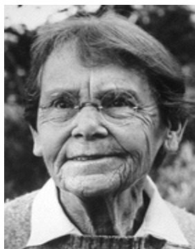
Barbara McClintock Nobel Laureate, Physiology or Medicine Cold Spring Harbor Laboratory