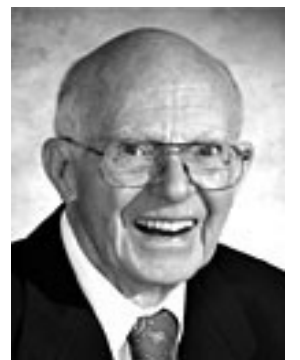
Raymond Davis Nobel Laureate, Physics Brookhaven National Laboratory

For More Information on the Induction Process, Please call (631) 632-4625