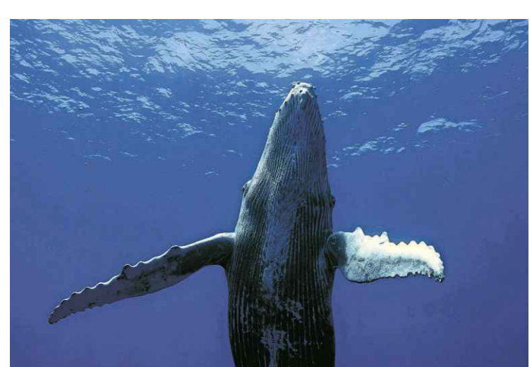
A still from the new film "Ocean Odyssey" at the Cradle of Aviation.

ence" permanent exhibition, Suffolk County Historical Society Museum, 300 W. Main St., Riverhead So you think you know about life on Long Island? This new "museum within the museum" is ready to test and expand your knowledge. A time-