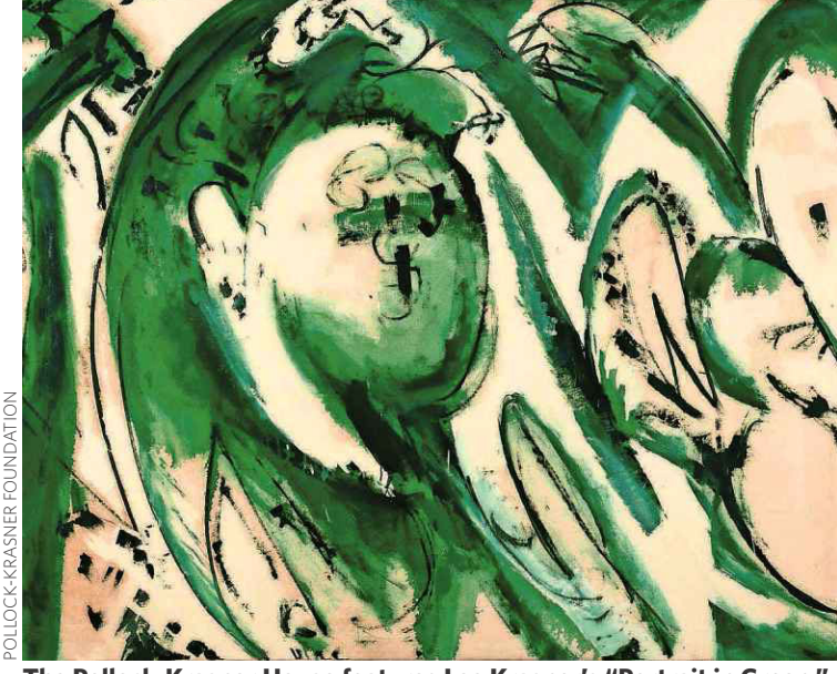
The Pollock-Krasner House features Lee Krasner's "Portrait in Green."