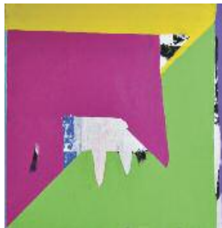
Clockwise from upper left: Alter Ghost , The Cave and Its Guardian , Magenta Vampyr , The Siren's Eye , all 2014 Opposite: Space 1999-HHA , 2014