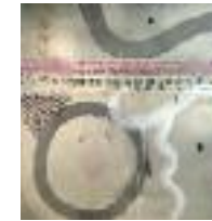
Singing La La La