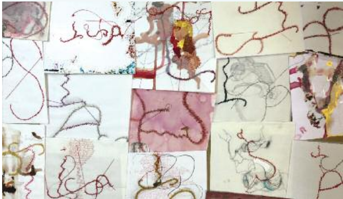
Stitched Baybayin (detail)