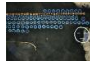
Some Kind of Magic