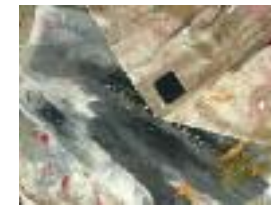
The Stories We Write